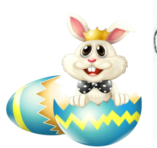
Thursdays @ I:00 Sharp April 3, 10, 17, 24